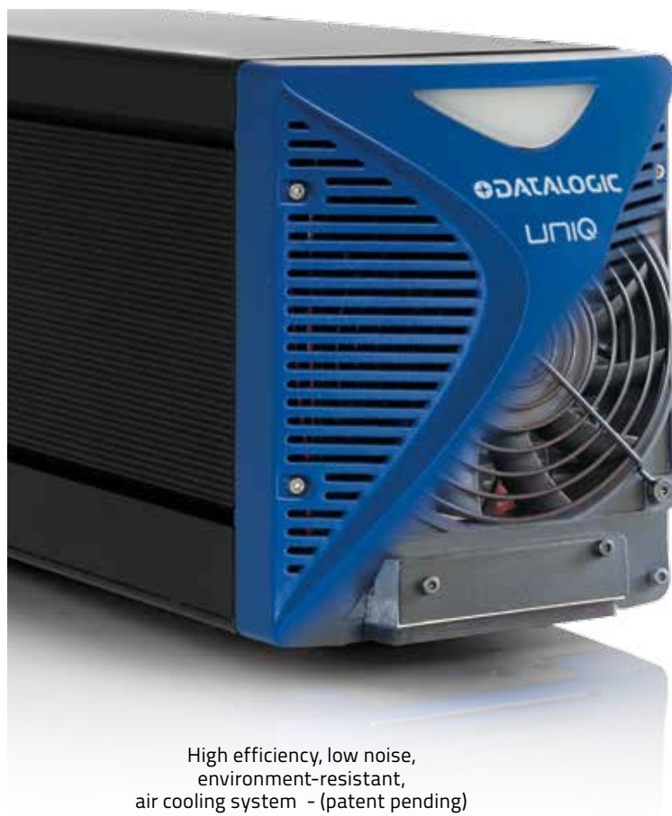
High efficiency, low noise, environment-resistant, air cooling system - (patent pending)

Laser interaction with organic or inorganic material can cause TOXIC FUMES/PARTICLES. The OEM laser components described in this product guide is for sale solely to qualified manufacturers, who shall provide interlocks, indicators and other appropriate safety features in full compliance with applicable national and local regulations.