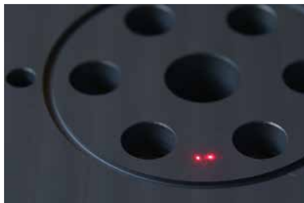
Twin beams for easy focus finding