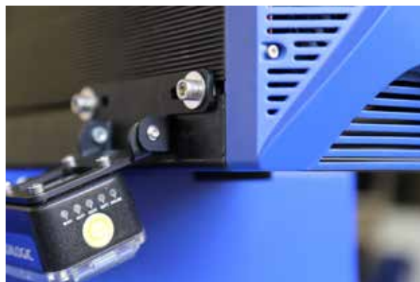
EasyFix mounting rail for accessories