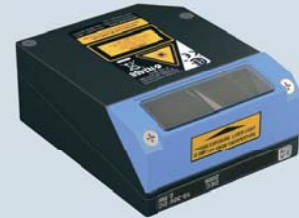
GFC-2100 90° Mirror Solution