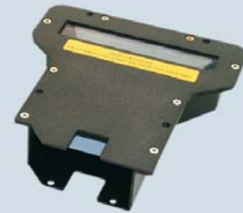
GFC-200 Contact Reading Mirror