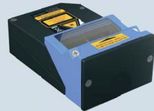
OM2000 Oscillating Mirror