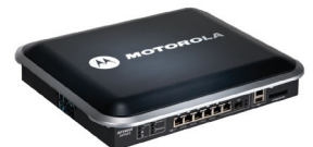
RFS 4011 available only with WiNG 5.

RFS-4011-11110-WR: RFS 4000 Services Controller with Integrated Dual Radio Access Point for Worldwide (excluding US)